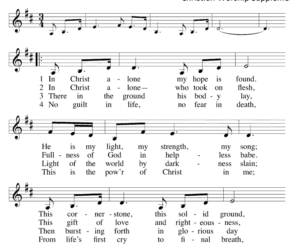
Hymn continues on the next page

Firm through the fierc - est drought storm. and Scorned by the ones he came save. to from the grave he rose a gain! Je - sus com -mands my des tin - y. What heights of love, what depths of peace, Till on that cross. Je - sus died, vic - tor And he stands - y, No hell. pow'r of scheme of man When stilled. striv - ings fears cease! The God sat - is fied: wrath of was Sin's curse has its grip lost on me. hand; Can ev - er pluck me from his Com - for - ter, all My all. my in For ev -'ry sin on him was laid. For his and he is mineam re - turns calls me home, or (Fine) in of Christ stand. Here the love Here in the death of Christ live. Christ. Bought with the pre - cious blood of in the pow'r of Christ 1'11 stand.