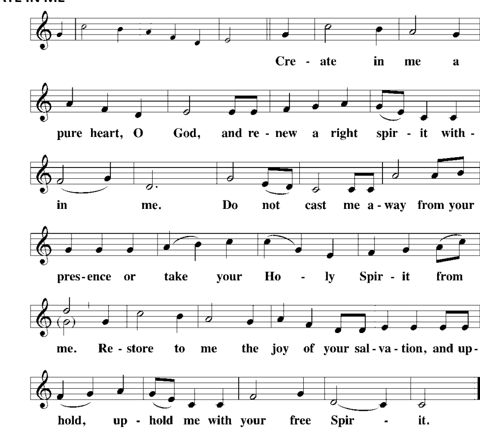
Please Be Seated